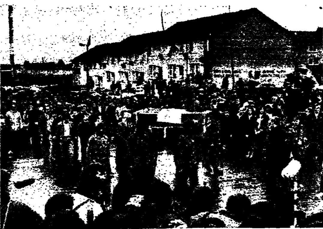
Bobby Sands' coffin was borne through the streets of Belfast to a church on Wednesday.